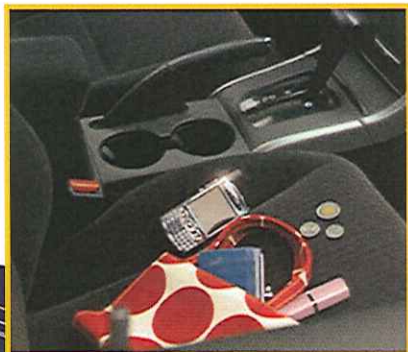
UNATTENDED VALUABLES IN YOUR VEHICLE IS JUST THE OPPORTUNITY A THIEF IS LOOKING FOR...